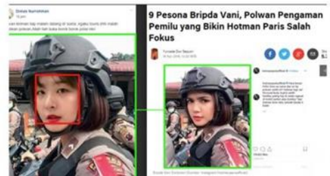
Figure 1. The results of a search for a news story that comes from a picture, which states that there is police smuggling from China

Hoaks booster tools is a tool or application that can easily help us find the truth of an existing news story, even if it's only with a photo. In the HBT or Hoaks Booster Tools there are many sources of information that we can look for the truth, the way HBT works is quite simple and very easy to make people later when looking for a news truth it will be very easy to apply.